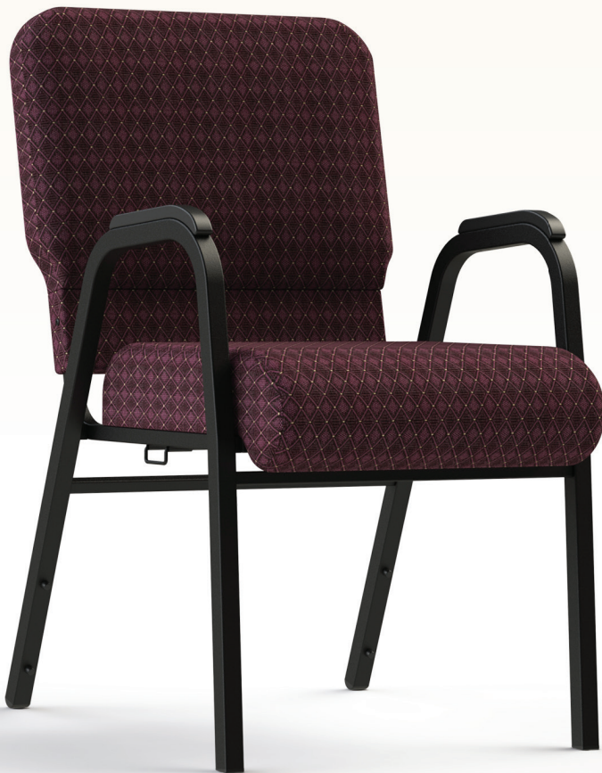
Shown in DS 1109 Quad Purple / Textured Black Frame w/ Optional Cutaway Back

Armed, 20" Wide Enclosed Back (Straight)