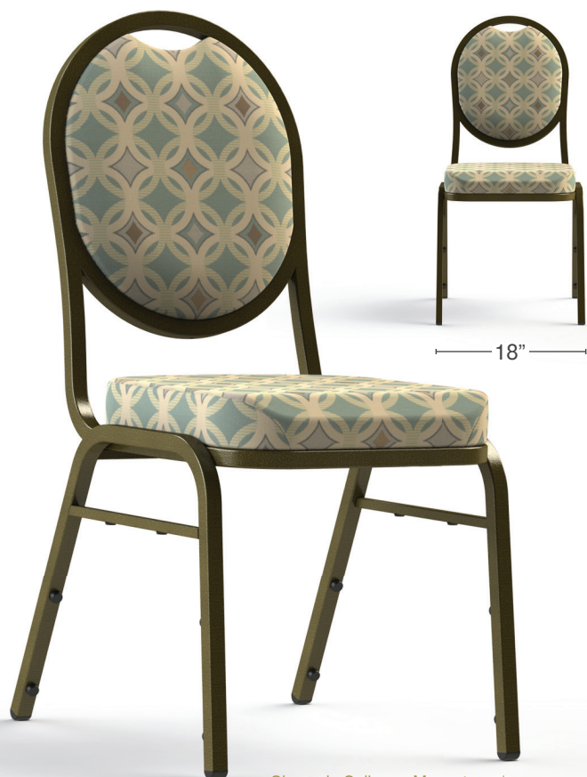
Shown in Salinas - Moonstone / Antique Brown Frame